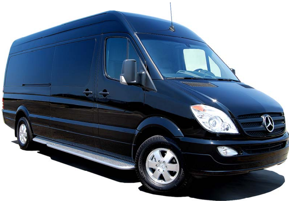
Exterior of SLS Becker JetVan