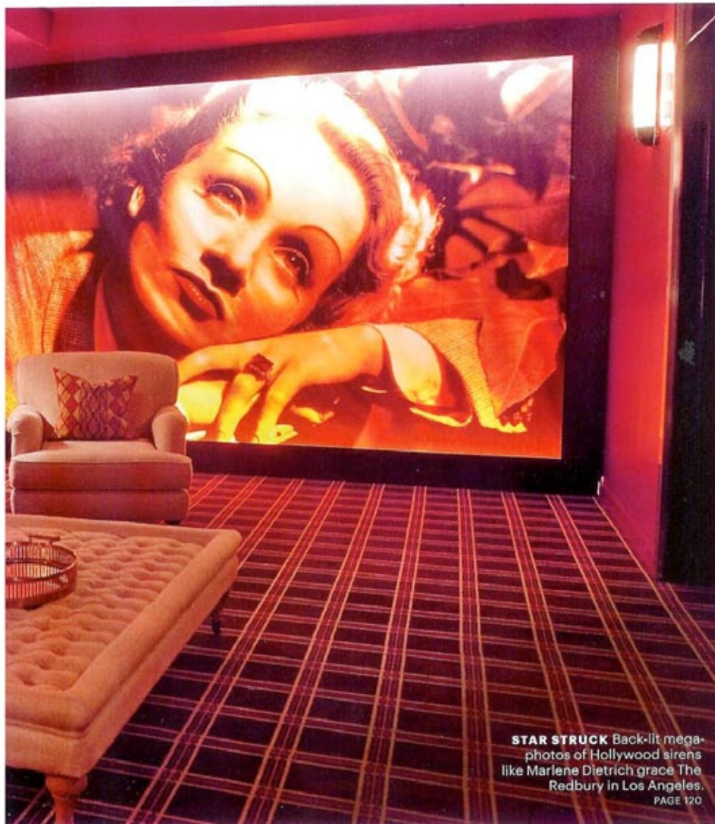
STAR STRUCK Back-lit megaphotos of Hollywood sirens like Marlene Dietrich grace The Redbury in Los Angeles. PAGE 120

known: Rooms have Cuban-style tiled floors, leather armchairs, raw concrete beams, Mad Men -esque wet bars (complete with a lemon and a lime), and family-size showers stocked with products from the hotel's spa. Blue-and-white towels cover wide loungers on the strip of private beach (complete with red iceboxes and watering cans to rinse feet) and daybeds by the large downstairs pool, and cabanas flank the eighth-floor plunge pool and cocktail bar. There are two more bars—a Latin-themed lounge serving punchy caipirinhas and a tiki bar abutting the beach—and the lively Cecconi's restaurant does pricey but pitch-perfect steaks and pizzas. The labyrinthine Cowshed Spa takes its name to heart with rough-hewn wooden walls. There's even a small screening room should the weather turn inclement. WHICH ROOM TO BOOK: For a turquoise view, spring for a Beachside room, the smallest of